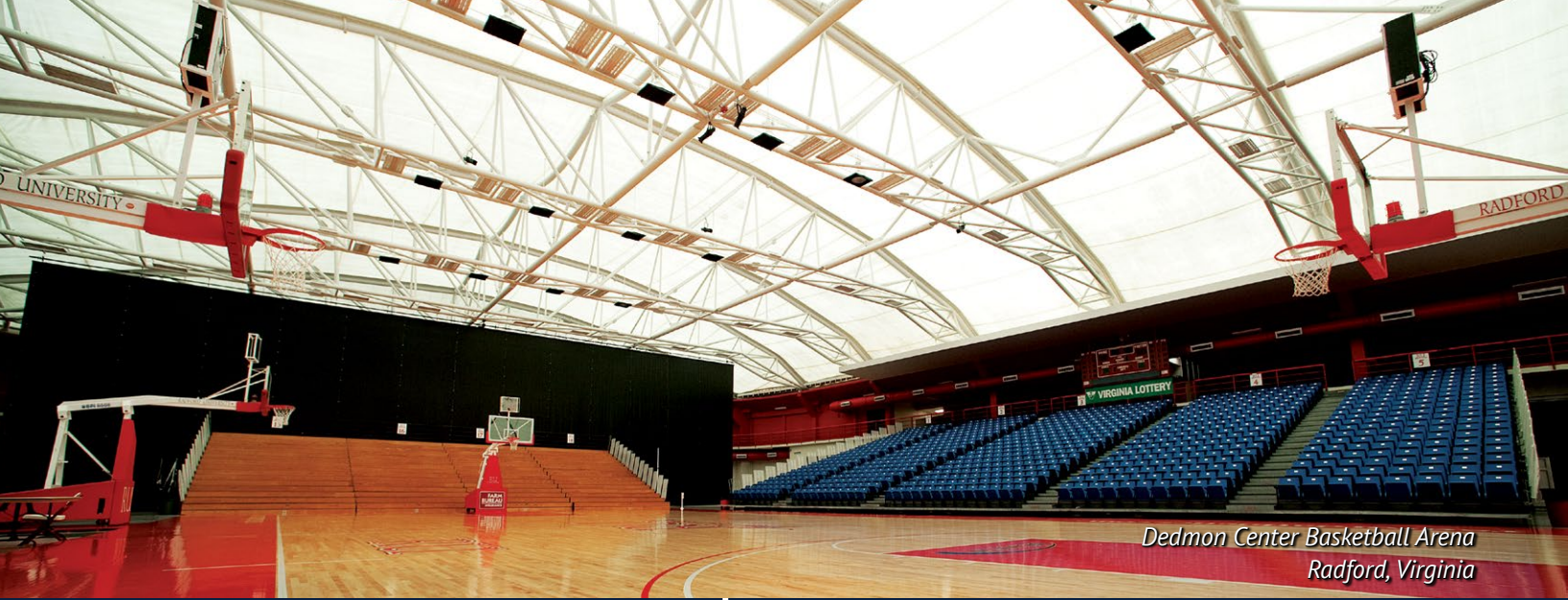
Dedmon Center Basketball Arena Radford, Virginia