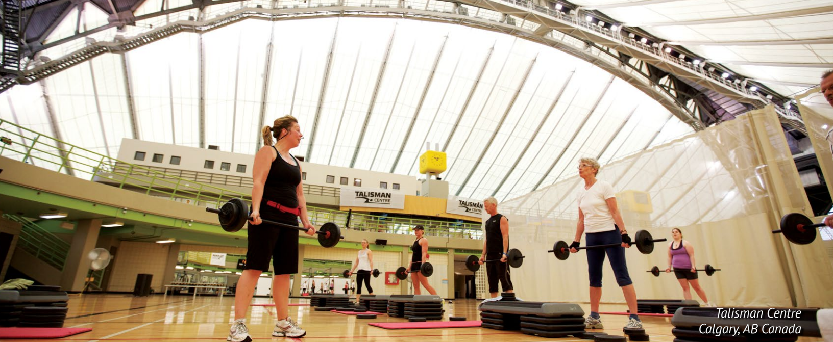
Talisman Centre Calgary, AB Canada