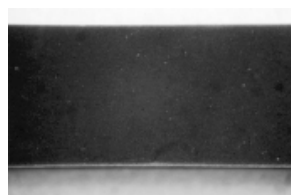
SPHERON® 6000 CB, 105 phr