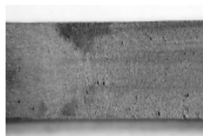
ASTM N683 CB, 82 phr